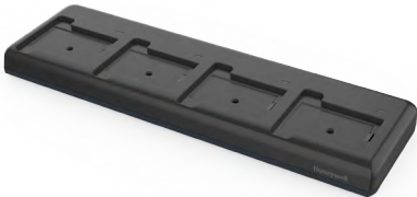
EDA52-QBC-1 | EDA52-QBC-2 | EDA52-QBC-3 EDA52-QBC-5